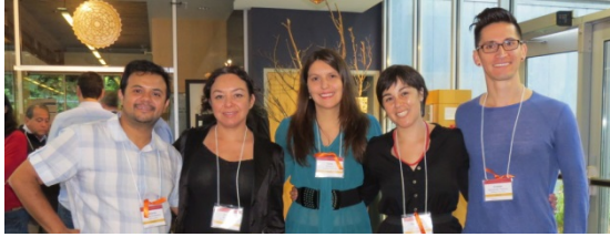
REDICEC Directors 2013-2015

REDICEC is a non-profit organization registered under the Canada Non-for-profit Corporations Act #919564-5. REDICEC congregates researchers from the industry and academia from diverse areas of knowledge and at different stages of their professional development: Governmental Officials, University Professors, Graduate and Undergraduate students that conduct studies or work on topics related to Chile and/or Canada. REDICEC seeks to be a bridge to facilitate academic and research collaboration between Chile and Canada, fostering the generation of ties with the academic and scientific fields in Chile and contributing to the debate on public policies related to the development of research and innovation in all areas of knowledge.