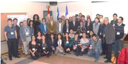
I Colloquium REDICEC Montreal, 2013

"Mobilizing knowledge for a sustainable society" is the topic of this year's event. REDICEC's members understand that building a sustainable society is an urgent matter that requires everyone's participation. In this regard, REDICEC seeks to create an opportunity for thought and action in which researchers and professionals from diverse disciplines will be able to learn and voice their opinions about how to achieve sustainability. The challenge is to define the particular contributions that each area of knowledge and innovation can provide to bridge the gaps between the current Chilean socio-cultural and economic goals and structures and the required meaning frames and actions for a sustainable society. This year's colloquium invites those who foster knowledge to discover their role in creating a sustainable society and to implement critical coalitions that seek social and environmental justice in our home country Chile.