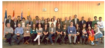
II Colloquium REDICEC Vancouver, 2014